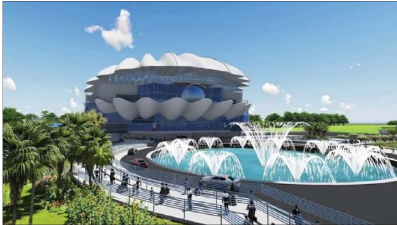
Cox's Bazar Railway Station.