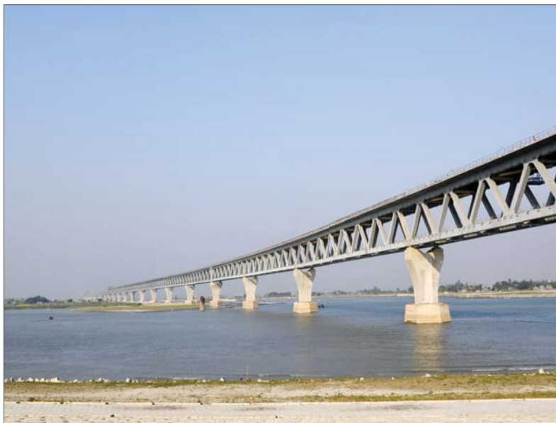
Padma Multipurpose Bridge.