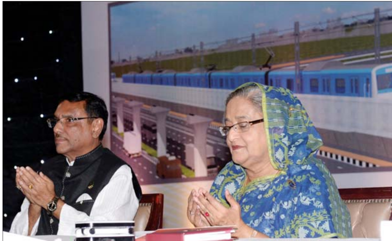
Honourable Prime Minister Sheikh Hasina inaugurates construction work of Metro Rail (June 26, 2016).