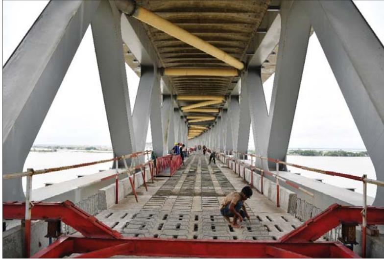
The construction work of the Padma Multipurpose Bridge is progressing.