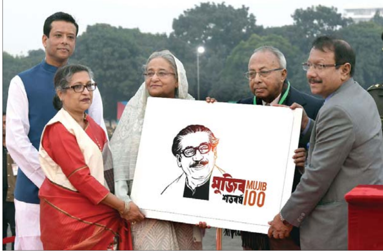
Honourable Prime Minister Sheikh Hasina unveiling the Mujib Borsho logo at the Tejgaon Old Airport in Dhaka (January 10, 2020). She started countdown for the birth centenary celebration and Homecoming Day of Father of the Nation Bangabandhu Sheikh Mujibur Rahman.