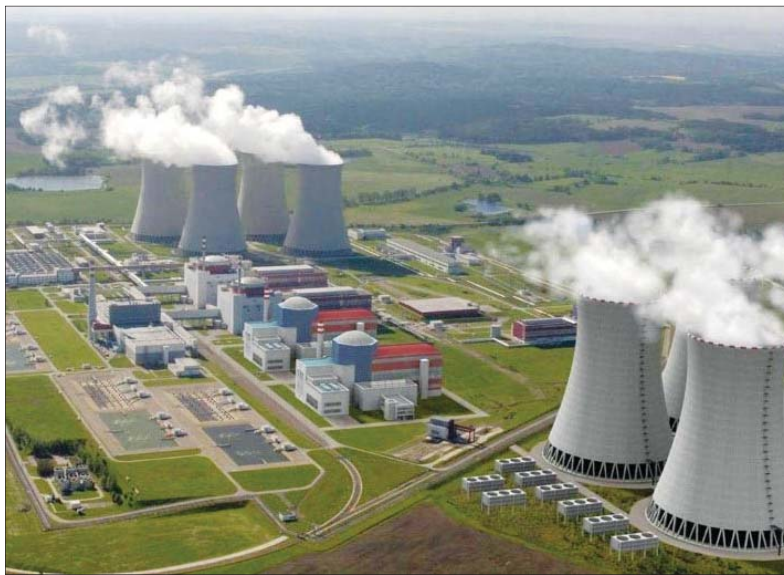
Rooppur Nuclear Power Plant.