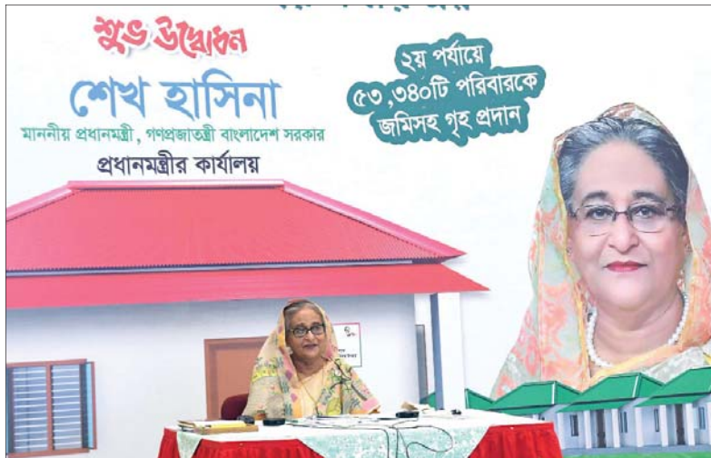
On the occasion of Mujib Borsho, Honourable Prime Minister Sheikh Hasina addresses inaugural function of distribution of newly constructed houses (Phase II) among 53,340 homeless families across the country through video conference from Ganobhaban (June 20, 2021).