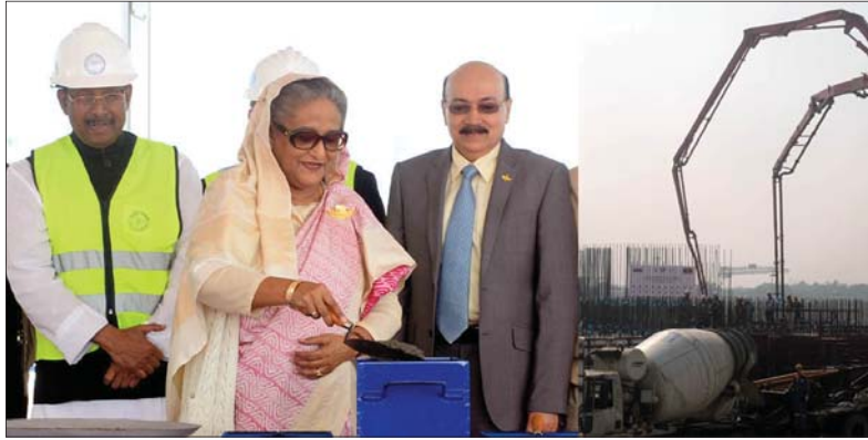
Honourable Prime Minister Sheikh Hasina inaugurates the first concrete casting of the country's first ever nuclear power plant at Rooppur (November 30, 2018).