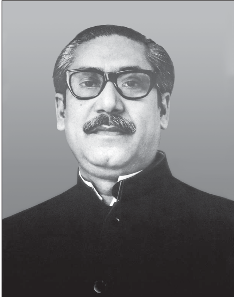
Father of the Nation Bangabandhu Sheikh Mujibur Rahman