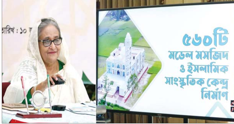
Honourable Prime Minister Sheikh Hasina marking Mujib Borsho virtually inaugurates the first 50 mosques under the project 'Construction of 560 Model Mosques and Islamic Cultural Centres Across the Country' (June 10, 2021).