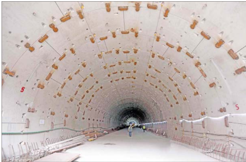
The construction work of the Karnafuli Multilane Tunnel is progressing.