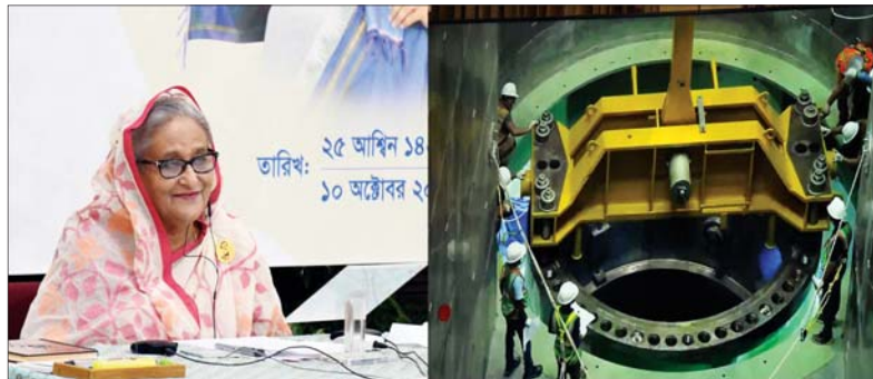
Honourable Prime Minister Sheikh Hasina inaugurates the installation of Reactor Pressure Vessel of the Rooppur Nuclear Power Project, Unit-1 through video conferencing from Ganobhaban (October 10, 2021).