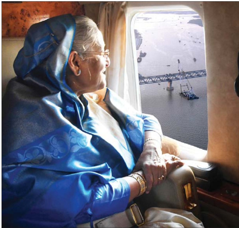
Honourable Prime Minister Sheikh Hasina inspects progress of construction work of Padma Bridge at Jajira point of Shariatpur (October 14, 2018).