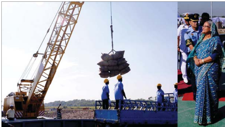
Honourable Prime Minister Sheikh Hasina visits the activities of the newly constructed Payra Seaport at Kalapara in Patuakhali (November 19, 2013).