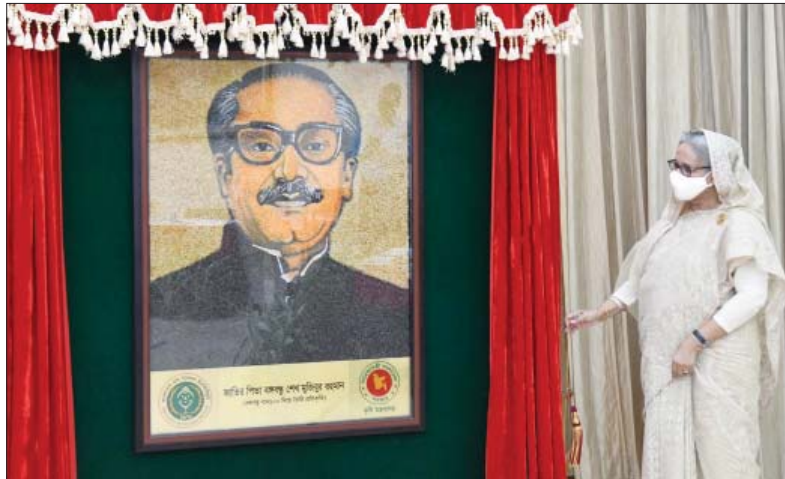
Honourable Prime Minister Sheikh Hasina while virtually attending the 'World Food Day 2021' function at the Hotel Intercontinental, Dhaka unveils a portrait of Father of the Nation Bangabandhu Sheikh Mujibur Rahman created with 'Bangabandhu Dhan 100' developed by Bangladesh Rice Research Institute marking Mujib birth centenary (October 16, 2021).