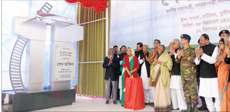
Honourable Prime Minister Sheikh Hasina inaugurates construction of the main bridge of the Padma Multipurpose Bridge Project at Mawa point in Munshiganj (December 12, 2015).