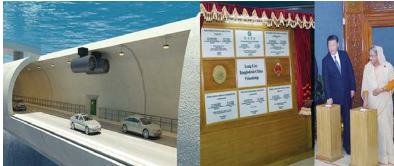
Honourable Prime Minister Sheikh Hasina inaugurates the Karnafuli Multilane Tunnel (October 14, 2018).